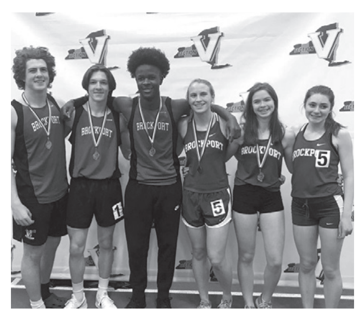
Indoor Track NYS representatives